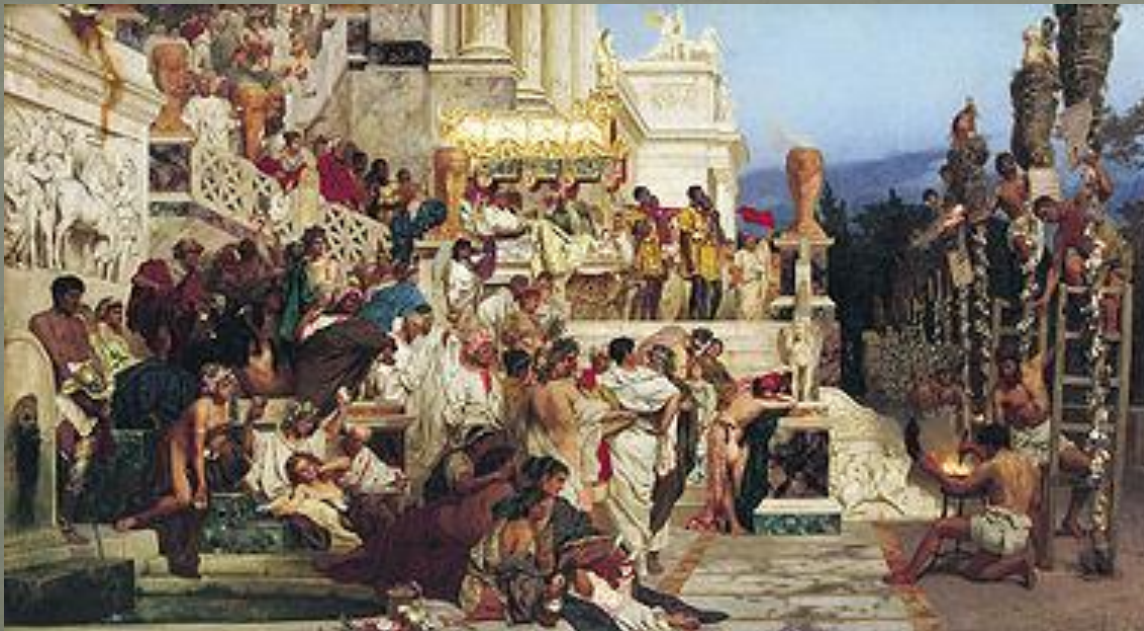
Torches of Nero